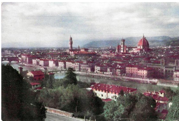
common image view

Postcards available to the general public were used throughout Pentothal mailings, with additional text added. Interesting to note is that this Selsun postcard was mailed July 31, 1956, the day before any known Pentothal cards were posted from Florence in their mass-mailing. There must be more to the connection in this story!