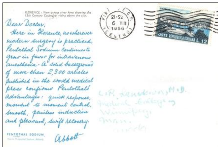
Pentothal reverse, mailed from Florence